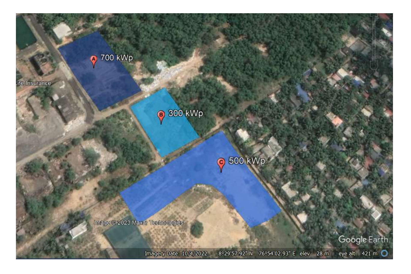
The Proposed 1.5 MW Solar Power Plant is to be installed on the area marked below

The balance 500 kWp is to be installed at the Rooftops of Buildings listed below: